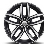
20" Twin 5-spoke aluminum wheels with Diamond Cut/Titan Satin finish