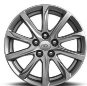
18" 10-spoke aluminum wheels with Bright Silver finish