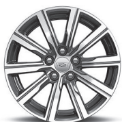
18" 10-spoke aluminum wheels with Diamond Cut/Argent Metallic finish