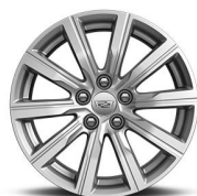
18" 10-spoke aluminum wheels with Pearl Nickel finish